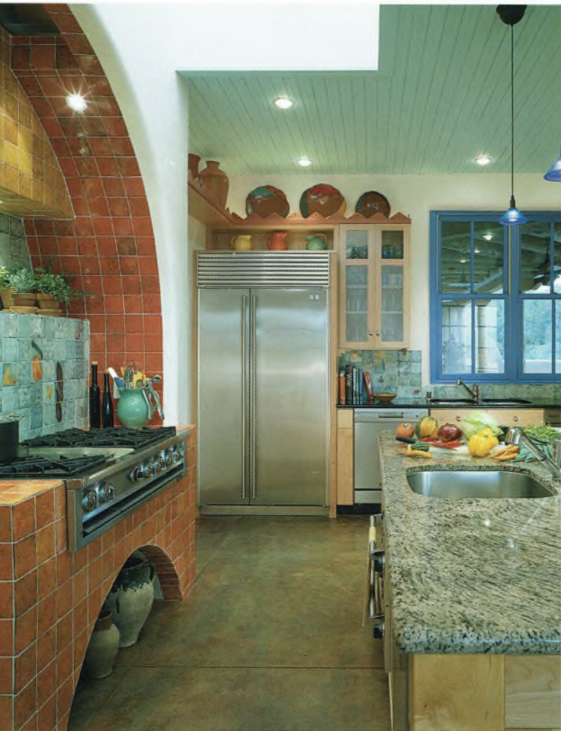
Above: The semicircular tiled alcove beneath the cooktop mimics the archway above it. Above right: In the butler's pantry, a playful cutout accesses the cats' litter boxes.